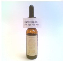
Indulge Indica Watermelon Zkittlez